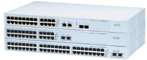
from top: 3Com Switch 4200 28-Port, Switch 4200 26-Port, Switch 4200 50-Port

Highly affordable, entry-level managed 10/100 Mbps connectivity for medium-sized businesses and branch office networks